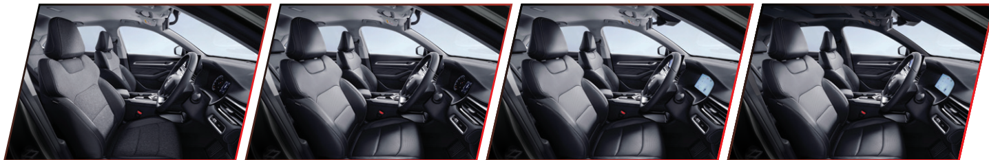
1.5TD Executive Fabric Seats