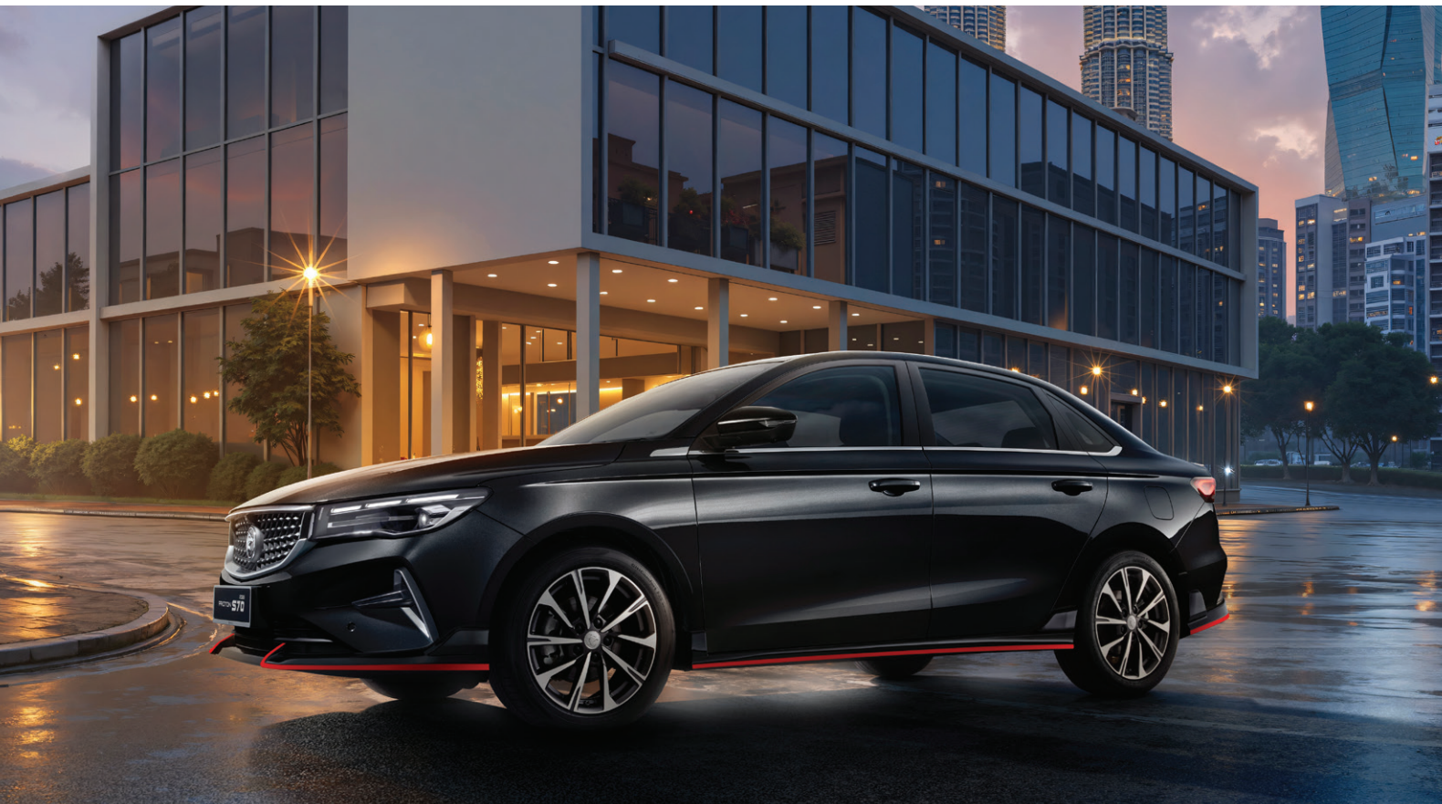
1.5TD Flagship X Leatherette Seats

All information detailed in this leaflet is correct at the time of printing. Perusahaan Otomobil Nasional Sdn. Bhd. reserves the right to make changes to the colours, features and/or other specifications detailed in this leaflet as well as discontinue any individual model without prior notice. The vehicles may differ slightly from those featured in this leaflet. Please consult your PROTON sales outlet to ensure the vehicle is in accordance with your expectations.