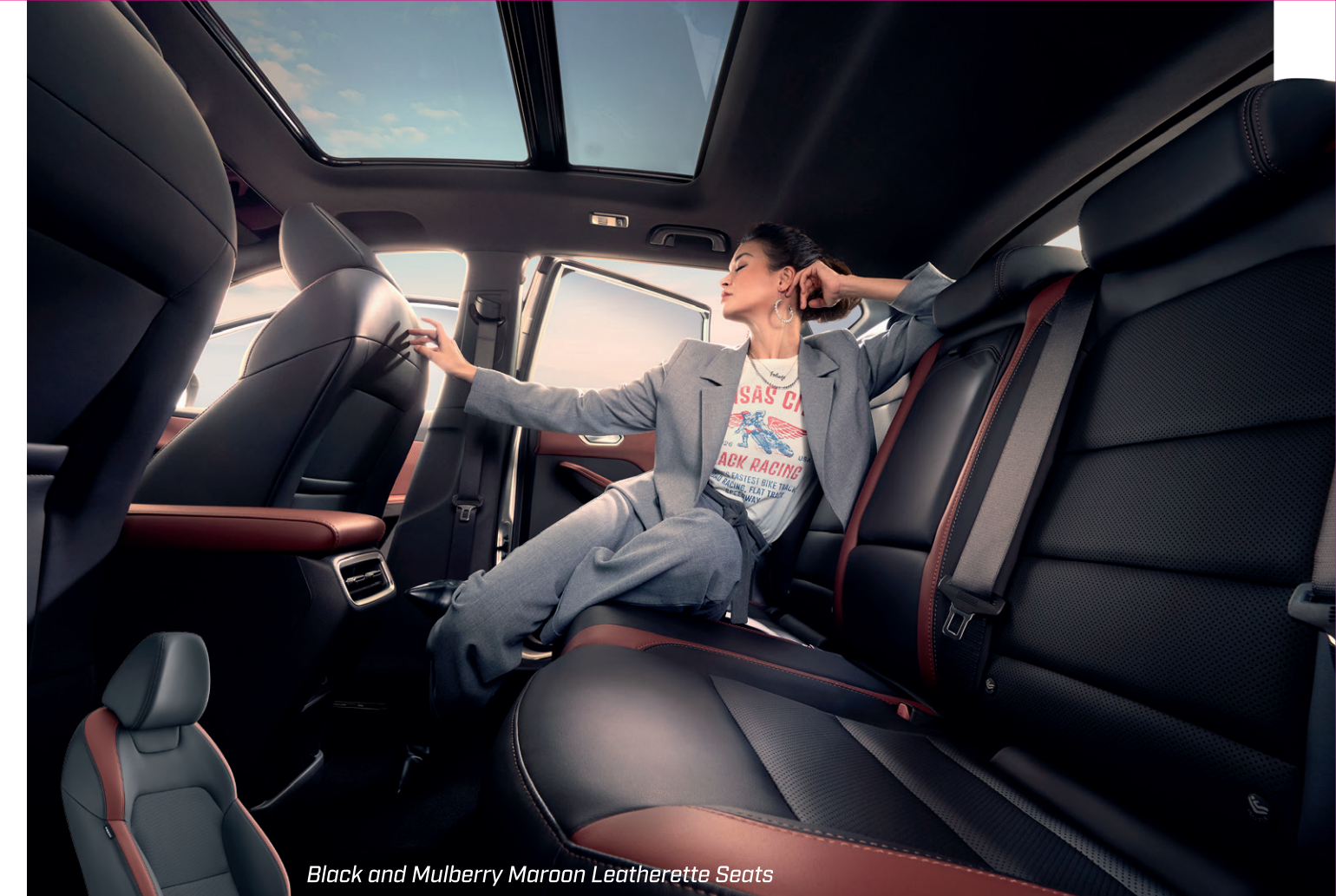
Black and Mulberry Maroon Leatherette Seats