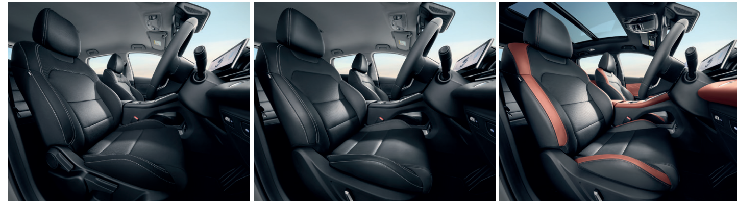
1.5TD Executive Black Fabric Seats